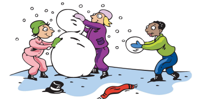
Youth Winter Retreat